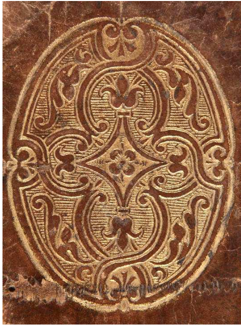
16 I 412, particolare.