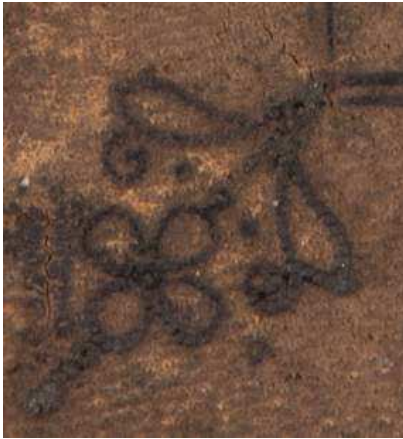
16 G 1127, particolare.