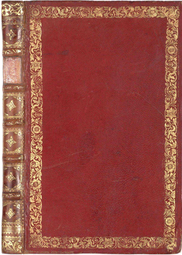
Den Haag, Koninklijke Bibliotheek, 1173D53.